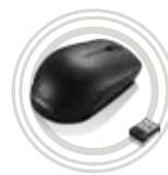
Lenovo™ 300 Compact Wireless Mouse