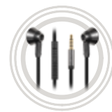
Lenovo™ 500 In-ear Headphone

* Example of Lenovo™ catalogue naming convention